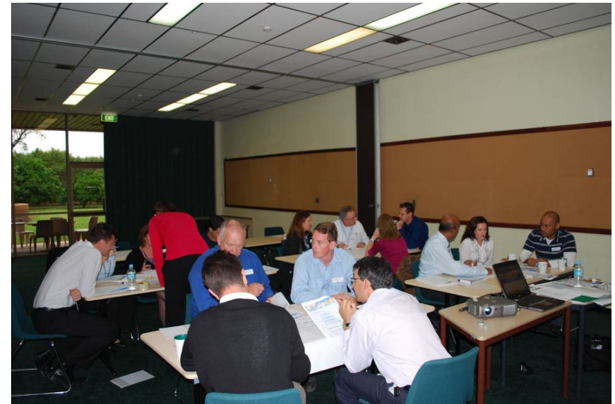
Above: Workshop participants at The Hills Shire Council's first risk assessment workshop (April, 2010)