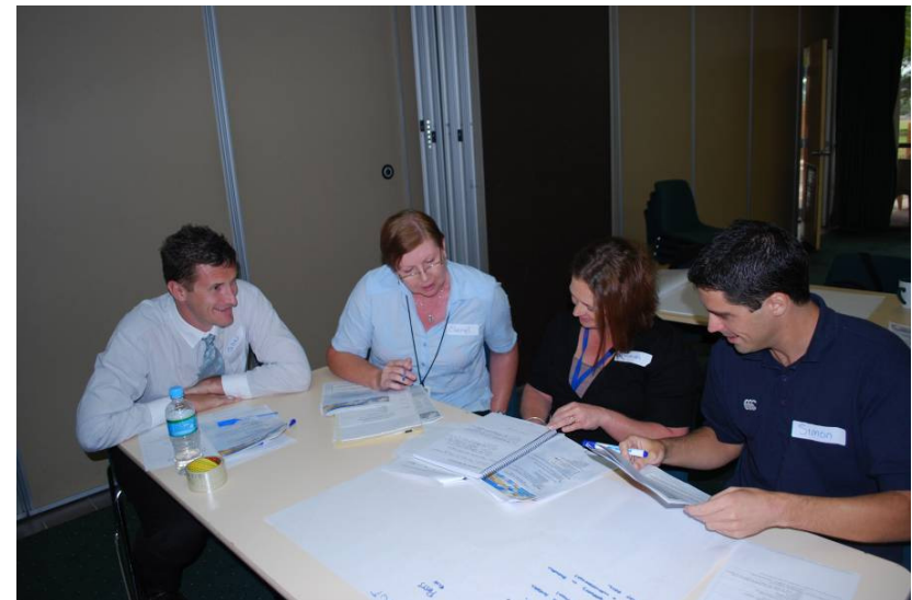
Above: Workshop participants using a Workshop Briefing Paper and handout at The Hills Shire Council's first risk assessment workshop (April, 2010)